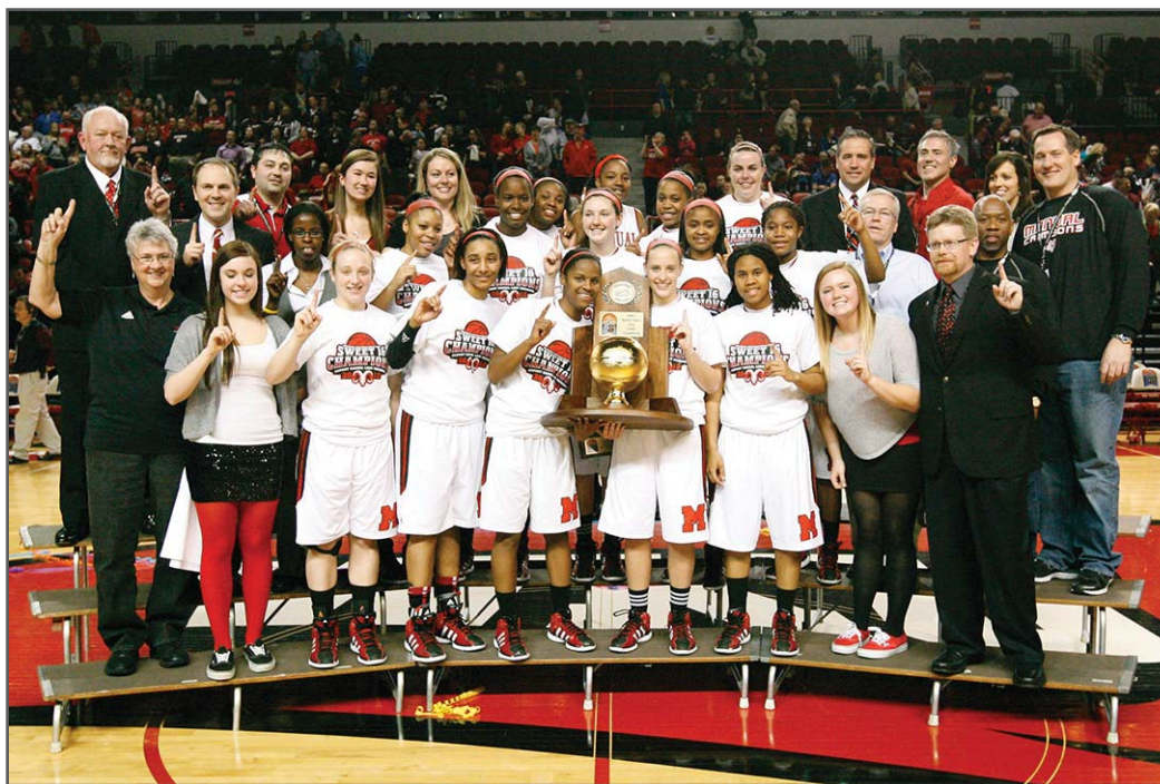
2012 State Champion - DuPont Manual