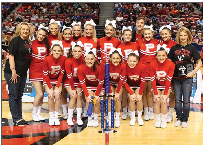
Girls' Sweet 16® Champions Perry County Central