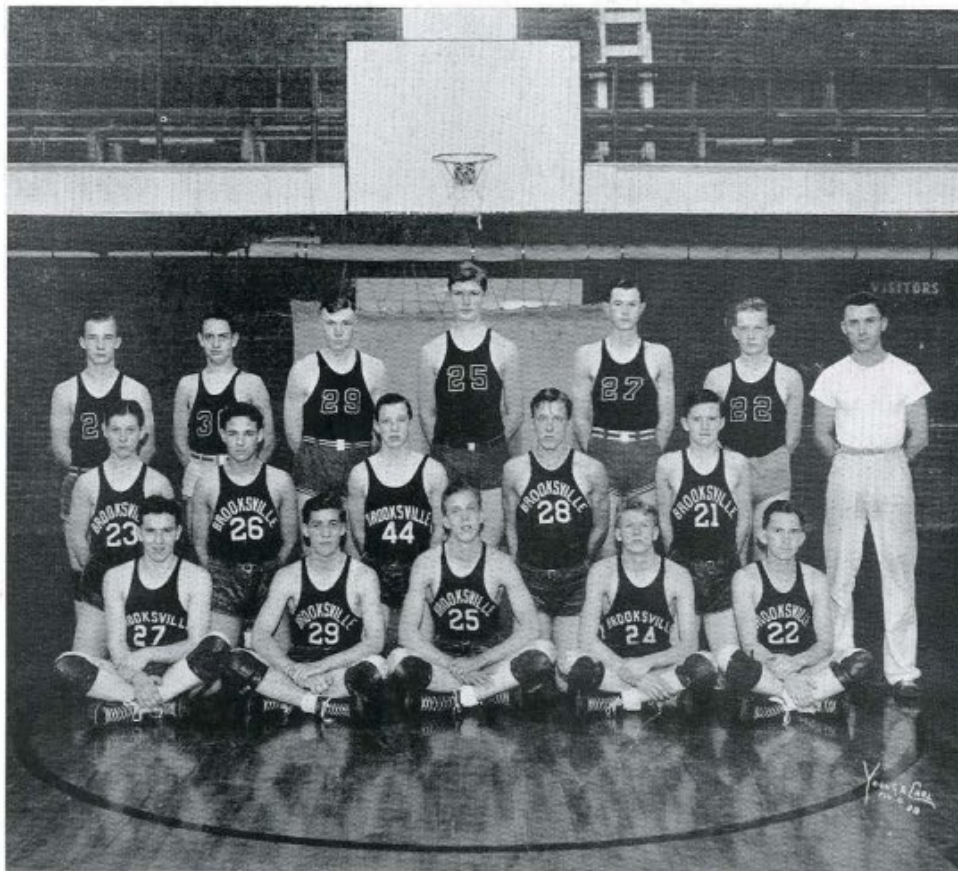
BROOKSVILLE POLAR BEARS - KENTUCKY STATE CHAMPIONS 1939