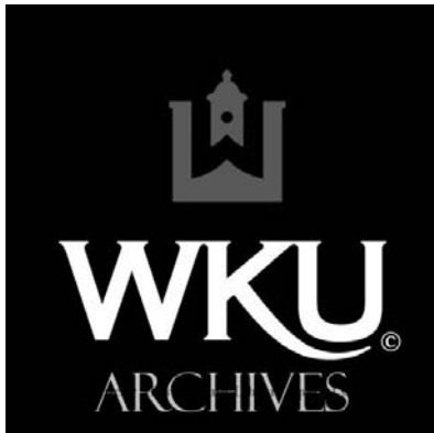
WKU Archives Logo

Kentucky Museum Library Special Collections