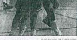
Ashley Cannon, Butler's top wrestler, in action during a match.