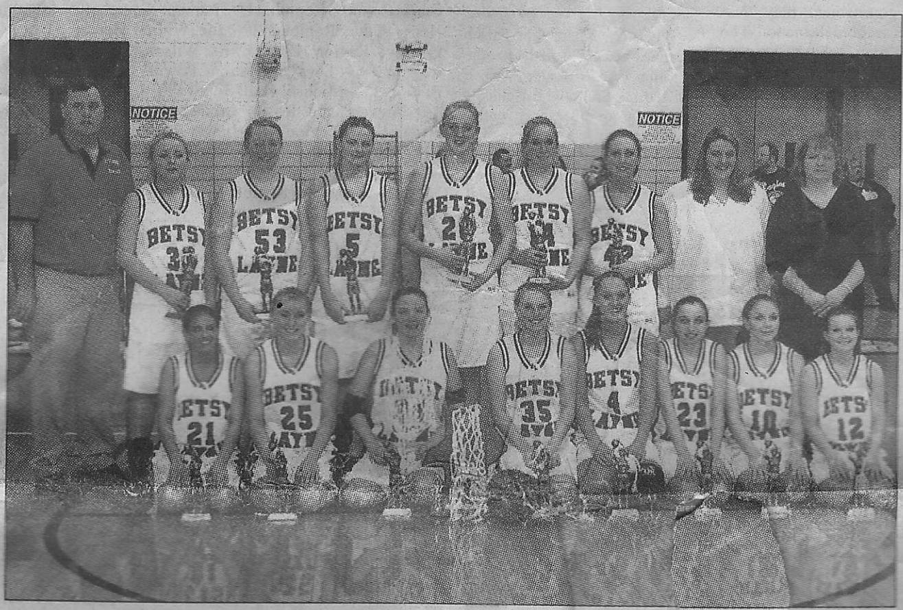
The Betsy Layne girls' basketball team shocked host Johnson Central for a 15th Region championship.